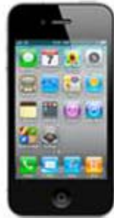
iPhone 4 GSM 機型