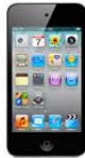
iPod touch (第4代)